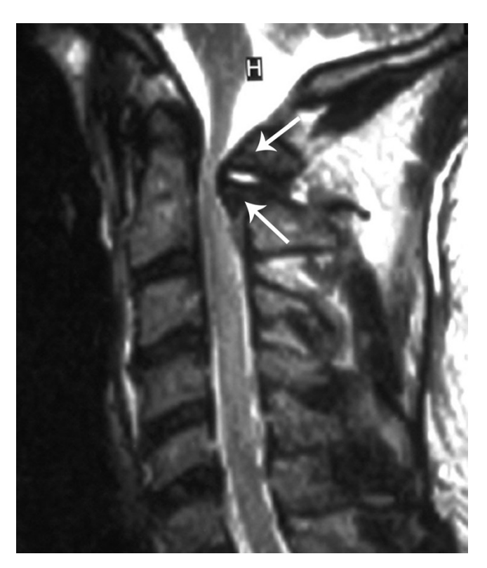
Figure 3 Sagittal T2 weighted MRI demonstrates an expansile lesion (arrows) of the posterior arch of C1 resulting in significant compression on the posterior thecal sac and spinal cord.

The patient had an uneventful postoperative course and at the latest follow-up, just over one year out of surgery, the patient was doing well without any complaints of neck discomfort or neurologic symptoms. Even so, given the lack of an intact posterior arch of C1, he was advised to