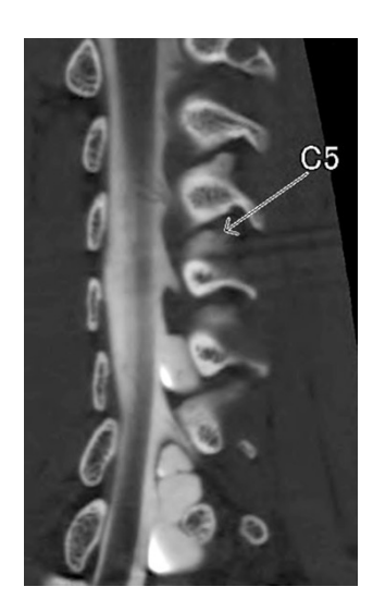
Figure 2 Oblique coronal view of computerized tomography myelography visualizing the dorsal rootlets.

menigocele were not visualized because of epidural puncture. These images were excluded from the study.