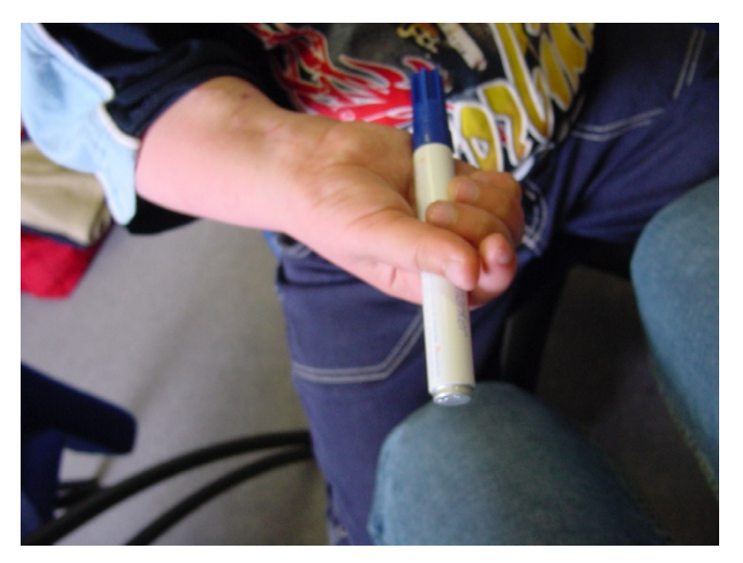
Figure 6 Postoperative function.

A good motor nerve connected with the shortest distance to a healthy and strong muscle which is adapted to the functional demand may result in a successfully reanimated major limb function. The reinnervation quality of the donor nerve could be followed by a progressing Hoffmann-Tinel sign along the anterior arm, but a qualitative assessment is only possible through histopathologic studies. The possibility of quantitative assessment of motor fiber content in the donor nerve is still under discussion [11].