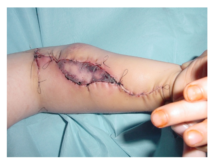
Figure 5 Intraoperative situation – closure.

The decision for the free muscle transfer was taken after one nerve biopsy in all children but one, where a second biopsy was mandatory six months later to show a sufficient reinnervation pattern. The first child had previously a SAN to ulnar nerve neurotisation at the proximal forearm level using a saphenous graft. In this case, the biopsy and the later nerve coaptation were made directly on the distal graft which was separated from the ulnar nerve.