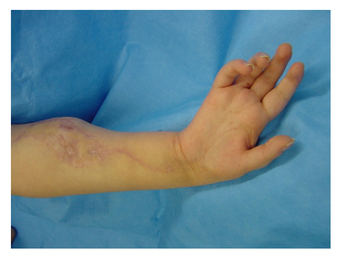
Figure I Preoperative flail hand.