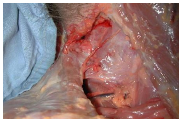
Figure 1 Trajectory of the spinal accessory nerve in the posterior triangle (cadaveric dissection).

Patients generally signaled incremental improvement during resection of fascia and/or interfascicular septae within the trapezius. Although the SAN neurolysis in