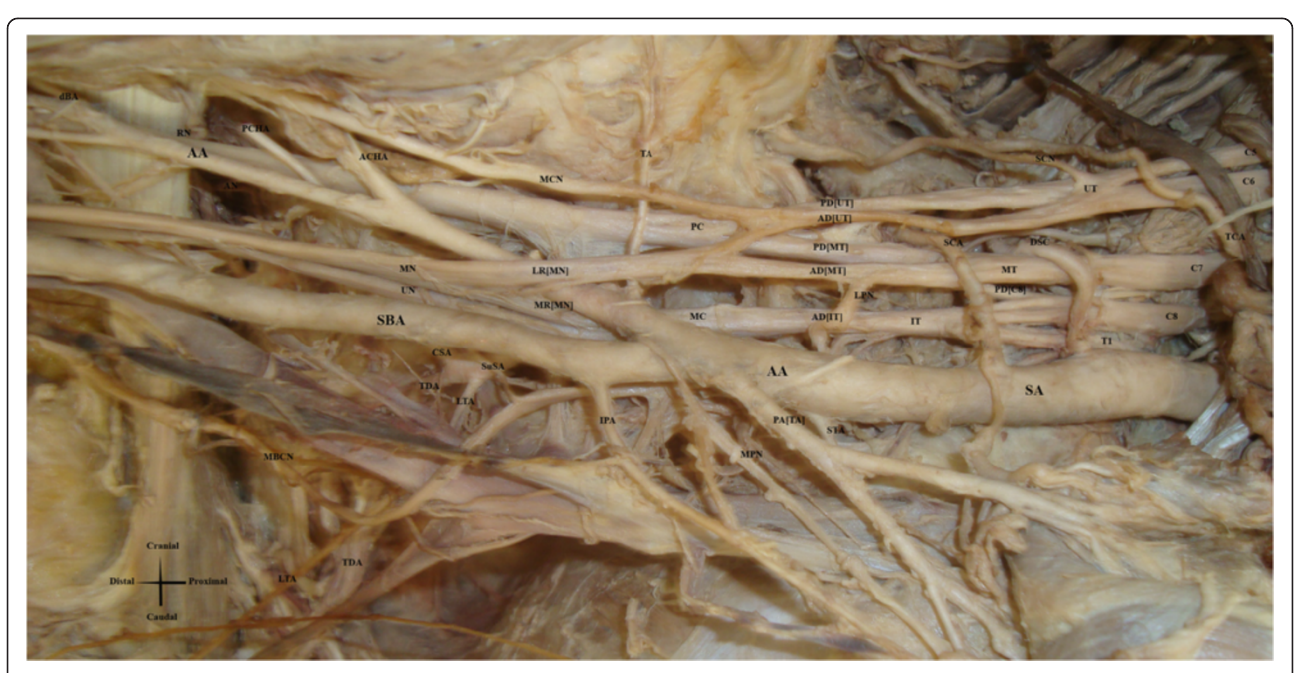
Figure 2 Cadaveric photo of variation of brachial plexus and axillary artery variations. UT: Upper trunk; MT: Medial Trunk; IT: Inferior Trunk; AD [UT]: Anterior division of Upper Trunk; AD [MT]: Anterior division of Middle Trunk; AD [IT]: Anterior division of Inferior Trunk; PD [UT]: Posterior division of Upper Trunk; PD [MT]: Posterior division of Middle Trunk; PD [C8]: Posterior division of C8; MC: Medial Cord; PC: Posterior cord; MR [MN]: Middle root of median nerve; LR [MN: Lateral root of median nerve; MCN: Musculocutaneous Nerve; MN: Median Nerve; UN: Ulnar Nerve; RN: Radial Nerve; AN: Axillary Nerve; SCN: Suprascapular Nerve; MBCN: Medial Brachial Cutaneous Nerve; LPN: Lateral pectoral nerve; MPN: Medial Pectoral Nerve; SA: Subclavian Artery; SCA: Suprascapular Artery; DSC: Deep Scapular Artery; AA: Axillary Artery; SBA: Superficial Brachial Artery; dBA: Deep Brachial Artery; DSC: Deep Scapular Artery; TCA: Transverse Cervical Artery; STA: Superior Thoracic Artery; TA: Thoracoacromial Artery; PA [TA] Pectoral Branch of Thoracoacromial Artery; SuSA: Subscapular Artery; LTA: Lateral Thoracic Artery; TDA: Thoracodorsal Artery; CSA: Circumflex Scapular Artery; IPA: Inferior Pectoral Artery; ACHA: Anterior Circumflex Humeral Artery; PCHA: Posterior Circumflex Humeral Artery.