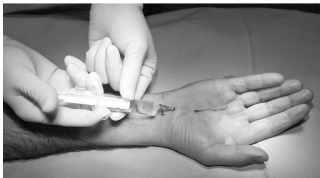
Figure 2 A second injection of 10 ml 1% prilocain subcutaneous at the volar side of the hand was done.

This study did not support the concept that performing LA increases risk for nerve damage or causes anatomical distortion [2,4]. The risk of transient or permanent nerve