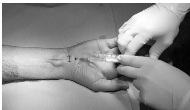
Figure 1 Subcutaneous infiltration of 10 ml 1% prilocain with a common 22G-Syringe-Needle in the palmar proximal wrist to block the median nerve.

Altissimi and Mancini [4] injected local anesthetic around the median nerve under the flexor retinaculum for open carpal tunnel release. This technique potentially reduces visibility, and thus has a significant risk of nerve injury [5]. Wood and Logan 1999 [5] gave a subcutaneous injection of local anesthetic to allow a proximal wrist incision and an intraoperative injection of local anesthetic using a catheter with a blunt ended trochar. This method is time consuming, especially in view of tourniquet pain. Moreover deflation and a new inflation trial are not possible in cases of venous congestion.